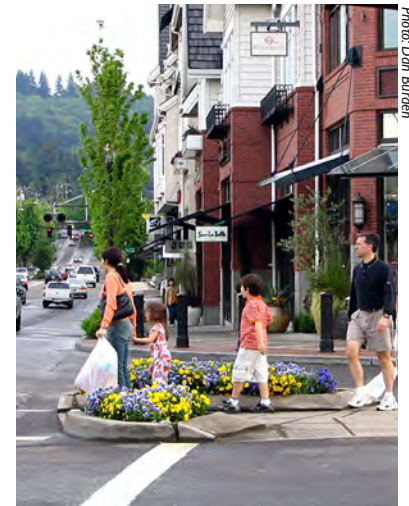
Complete streets create a safe environment for all users.

Complete streets encourage safer bicycling behavior. Sidewalk bicycle riding, especially against the flow of adjacent traffic, is more dangerous than riding in the road due to unexpected conflicts at driveways and intersections. A recent review of bicyclist safety studies found that the addition of well-designed bicycle-specific infrastructure tends to reduce injury and crash risk. On-road bicycle lanes reduced these rates by about 50%. 10